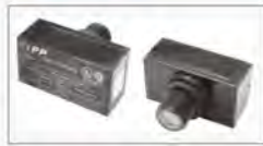
Optional photo control