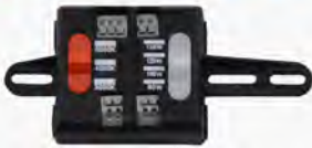
Patented Smart Controller